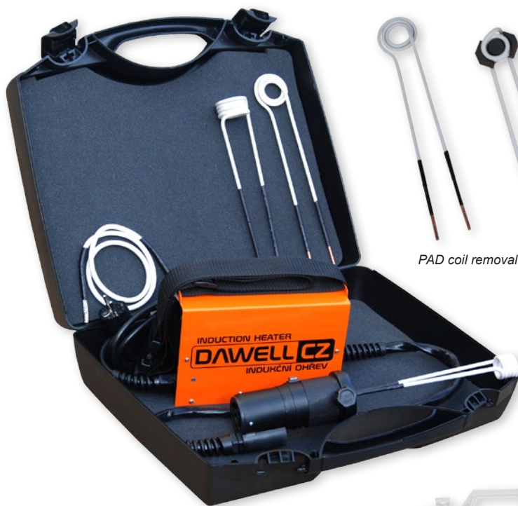
standard set of ind. heater: plastic case, FLEXI + PAD + 19 + 26 coils

DHI-15 system will heat a M12 bolt or a nut to a temperature over 800 °C in only 15 sec. The preparation and setup time for an induction heating system is much faster compared to an autogenous burner system. Simply connect the DHI-15 to a 230 V socket, install the appropriate coil type onto the part you wish to heat, then push the ON/OFF button to begin the induction process. The heating process is accomplished in seconds, even for parts requiring red hot temperatures. Induction coils may be easily replaced with bigger or smaller ones. The same applies to the heating coil to be wrapped around the part. A set of coils of various diameters may be ordered as optional items together with the induction heater.